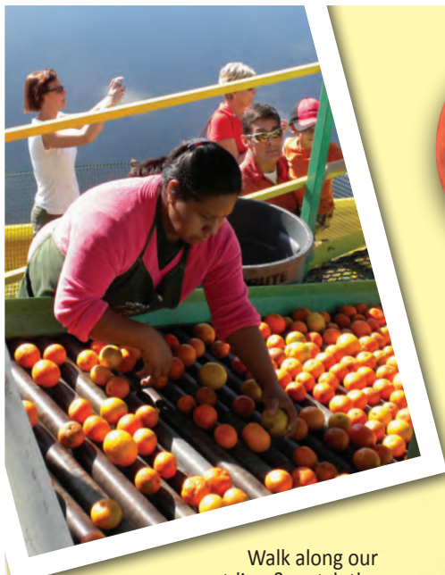
Walk along our wet-line & watch the fruit roll by!